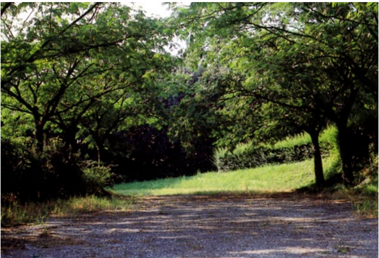
The gravelled car-park with Albizzia julibrissin, very naturalistic.

The list of plants used is given for several reasons: it is historically interesting, in that it gives Porcinai's typical palette; horticulturally interesting in that there is no supplementary watering after establishment, so these plants are more or less self-maintaining in that climatic zone, which has hot and fairly dry summers, but quite cold winters, with occasional snow on the ground - roughly equivalent to Hobart; and also of design interest, in that this is a `naturalistic' landscape in Porcinai's terms, accepting exotic plants, as Europe has done for centuries, but ones that are ecologically compatible. This is a very different understanding of `naturalistic' to that generally accepted in Australia.