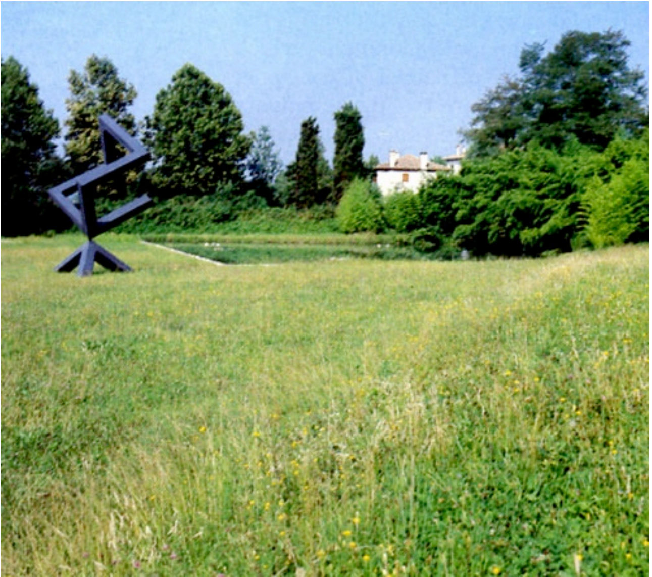
View north west to lake, bamboo and sculpture in meadow grass.

Where the wide, dull plains of the Veneto meet the great massif of Monte Grappa and the Altopiano di Asiago, there is first a line of gentle hills, green, fertile, facing south. To the east of the Brenta and Bassano del Grappa, Asolo crowns one of these hills, and to the west, Marostica, with its old castle walls climbing upwards; two of the prettiest towns in the Veneto. Between them, many of the finest Venetian villas are placed with care half up the hill-slopes, backed and flanked by fine trees, facing the sun in winter, but a little cooler than the oppressive plains in summer; they are sited with an understanding of all the best, age-old principles of environmental design.