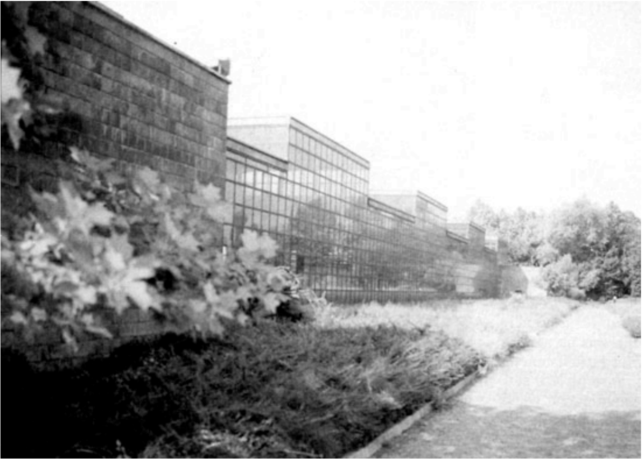
North elevation of building looking west. Note glass walling for soft lighting.

The worst problem is that the low hedges which are used everywhere for definition have been heavily invaded with Equisetum (scouring rushes) - an interesting and very ancient plant, but out of place here. However, most of the landscape is intended to look relaxed, almost a farm landscape, and heavy maintenance would be out of character.