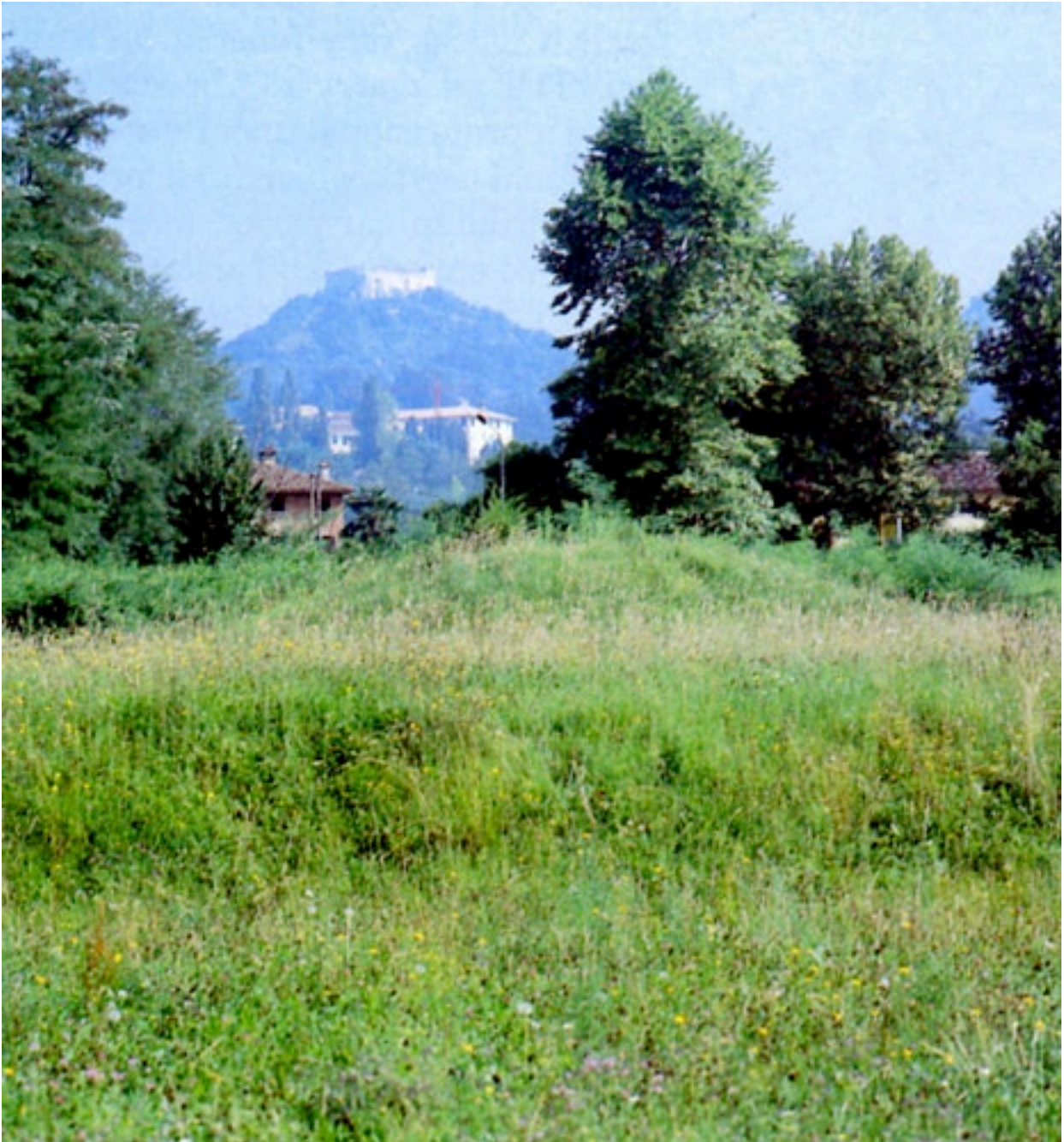
Carefully framed view of Aolo castle. Low mound in foreground 'introduces' background hill.