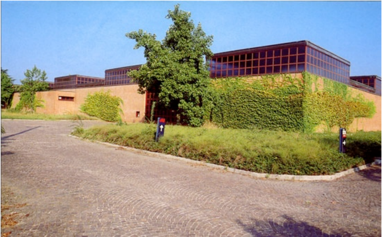
South façade of factory, with clerestory windows to avoid glare. Note trachyte blocks in fan-paving.

From Landscape Australia 1/1993 pp 57-60.